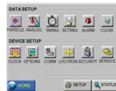
User Friendly Configuration